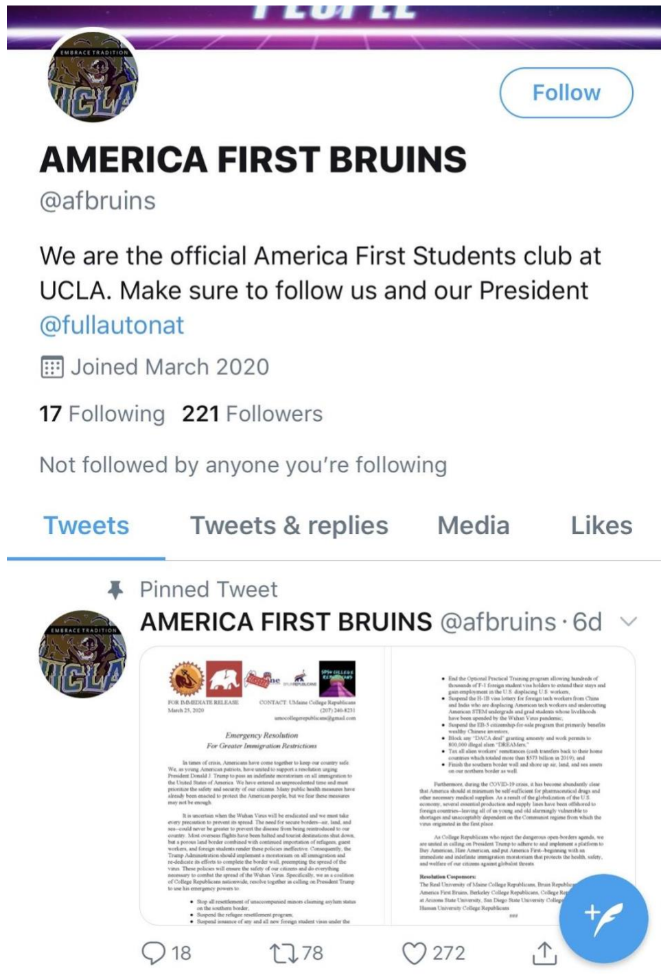
Figure 5: America First Bruins Twitter account (now deleted)