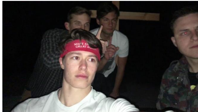
Figure 8: Bruin Republicans official club registration from the SOLE website. 123